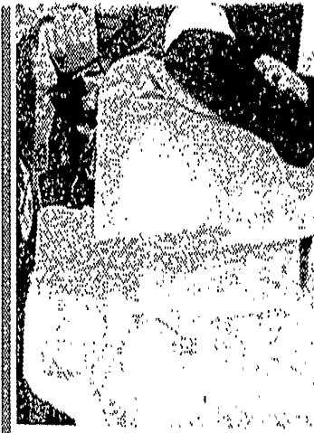
We backo Jacko... fans in London yesterday

Kroll is largely staffed by former CIA officers. One writer said: "If you want someone to dig up the dirt, they are the people." Pepsi denied the probe.