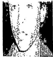
Jordy... 'abused by star'

"It is true he tried to reach an out-of-court